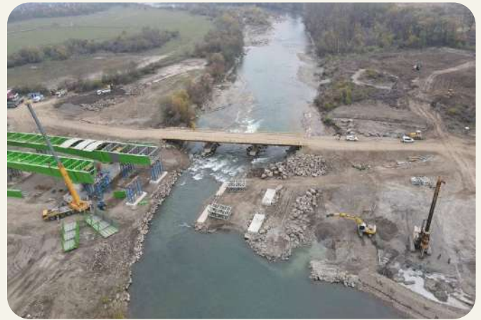
A bridge construction at the Bila Tserkva-Sighetu Marmatiei border crossing point, Zakarpattia region

*As of December 13th, 2024, according to regional military administrations since February 24th, 2022