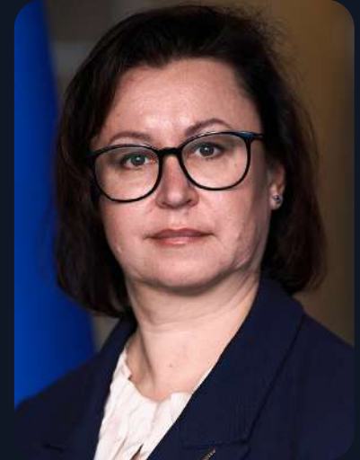
Natalia KOZLOVSKA, Deputy Minister for Development of Communities and Territories of Ukraine:

The funds have already been credited to Ukrposhta's current account. Currently, holders of housing certificates receive notifications in the Diia app or their account on the Diia portal about the booking of funds. Then, they choose a home and go to a notary to sign a purchase and sale agreement within 30 days. Cooperation with the Council of Europe Development Bank to support the affected people will continue in 2025.