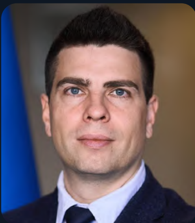
Serhii DEREKACH, Deputy Minister for Development of Communities and Territories of Ukraine:

Our task is to demonstrate that the driving profession has no gender and, most importantly, to have the necessary skills and desire to learn a new profession. At the same time, the project's goal is not just to train women but to provide them with employment, as this is the only way to overcome stereotypes and prejudices about "traditionally male professions." Today, the participants are preparing for practical truck driving