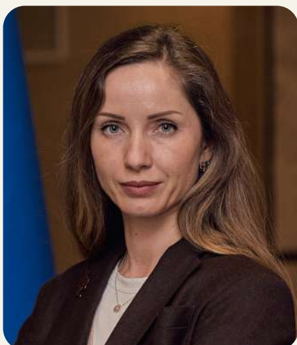
MARYNA DENYSIUK , Deputy Minister for Development of Communities and Territories of Ukraine