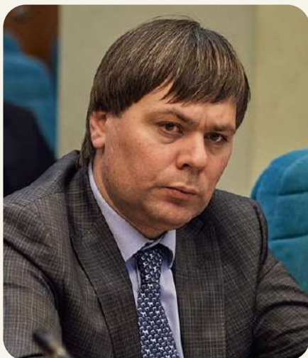
VASYL SHKURAKOV , The First Deputy Minister for Development of Communities and Territories of Ukraine