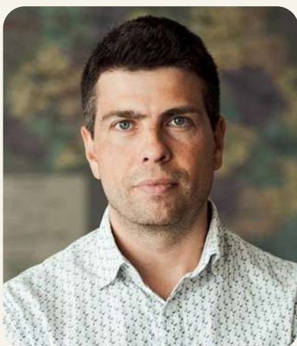
SERHII DERKACH , Deputy Minister for Development of Communities and Territories of Ukraine