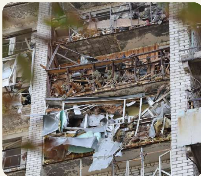
*As of November 1st, 2024, according to regional military administrations since February 24th, 2022