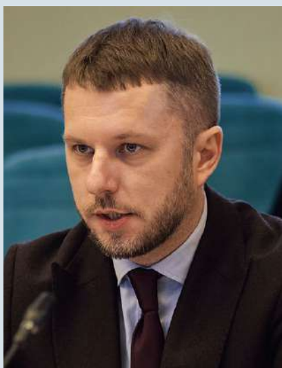
Oleksii RIABYKIN, Deputy Minister for Communities and Territories Development of Ukraine:

We are a result-oriented team. Therefore, developing effective mechanisms for prioritizing investment projects is extremely important. It is equally important to attract public funds as investments and create transparent conditions for the private sector. In this context, it is important to continue all the reforms launched, including Public Investment Management Reform, Decentralization Reform, and Public Administration Reform, to increase government agencies' capacity building and implement PPP projects at the community level.