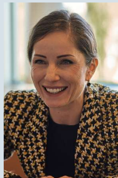
Maryna DENYSIUK, Deputy Minister for Communities and Territories Development of Ukraine:

We have a huge imbalance between the capacities of different regions. The regions near the frontline currently have no budget revenues, while the rear ones operate almost as they did before the war. Public investment is a matter of community cohesion. We plan to reflect this in the criteria for prioritizing projects at the regional level.