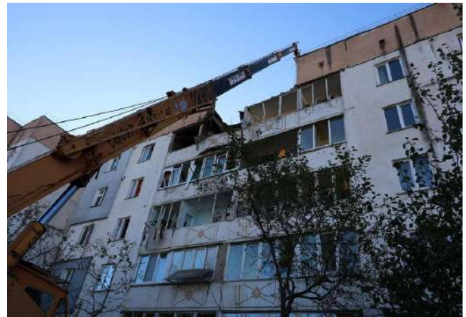
Damaged apartment building after a night drone attack in the Kyiv region

*As of October 25th, 2024, according to regional military administrations since February 24th, 2022