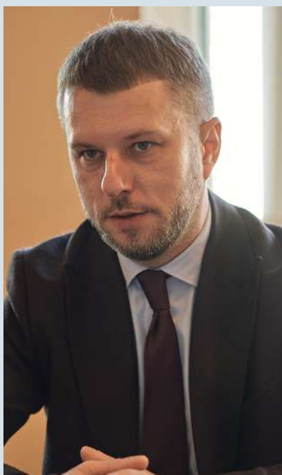
Oleksii RIABYKIN, Deputy Minister for Communities and Territories Development of Ukraine:

the Ukraine Investment Framework and the importance of applying a programmatic approach to selecting regional projects.