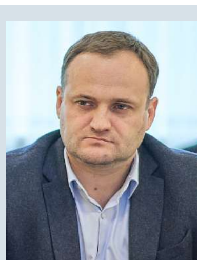
Oleksii KULEBA, Deputy Prime Minister for Restoration of Ukraine - Minister for Communities and Territories Development of Ukraine:

We are preparing for the heating season and considering the worst possible scenarios for Ukrainian cities. So far, Ukraine has received 160 cogeneration units from USAID. Creating a distributed generation system will be a priority for the coming years. We also continue to build passive protection facilities for energy infrastructure.