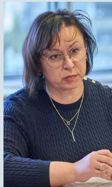
Natalia KOZLOVSKA, Deputy Minister for Communities and Territories Development of Ukraine:

Currently, this assistance accounts for 10% of the country's budget. We allocate funds for military needs and also assist the civilian sector, including humanitarian aid and infrastructure reconstruction projects. We also have a financial assistance strategy for Ukraine, where the priority is the direction of European integration.