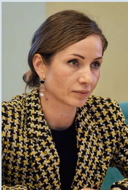
Maryna DENYSIUK, Deputy Minister for Communities and Territories Development of Ukraine:

We are a result-oriented team. Therefore, developing effective mechanisms for prioritizing investment projects is extremely important. It is equally important to attract public funds as investments and create transparent conditions for the private sector. In this context, it is important to continue all the reforms launched, including Public Investment Management Reform, Decentralization Reform, and Public Administration Reform, to increase government agencies' capacity building and implement PPP projects at the community level.