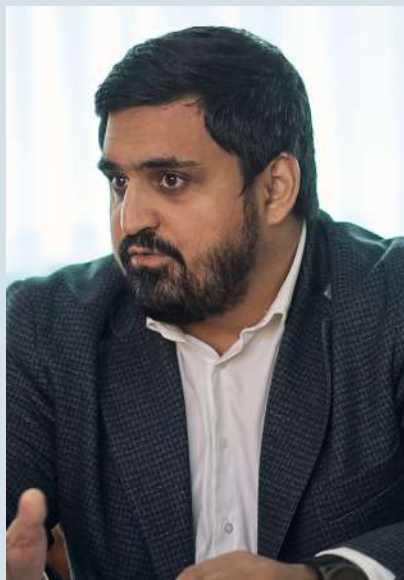
TYMUR TKACHENKO, Deputy Minister for Com- munities and Territories Development of Ukraine:

Ukrainian sea ports continue to operate despite the constant threat from Russia. Since August 2023, more than 2,800 vessels have arrived at Ukrainian ports, handling 76 million tons of cargo.