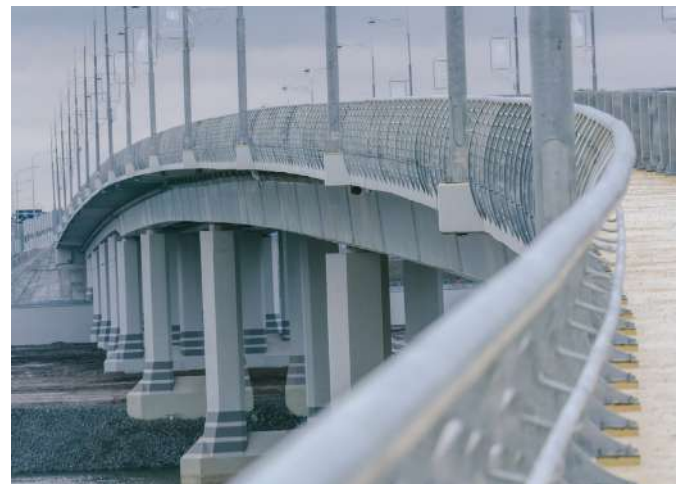
One of the most significant bridges in the Chernihiv region has been restored

*As of October 18th, 2024, according to regional military administrations since February 24th, 2022