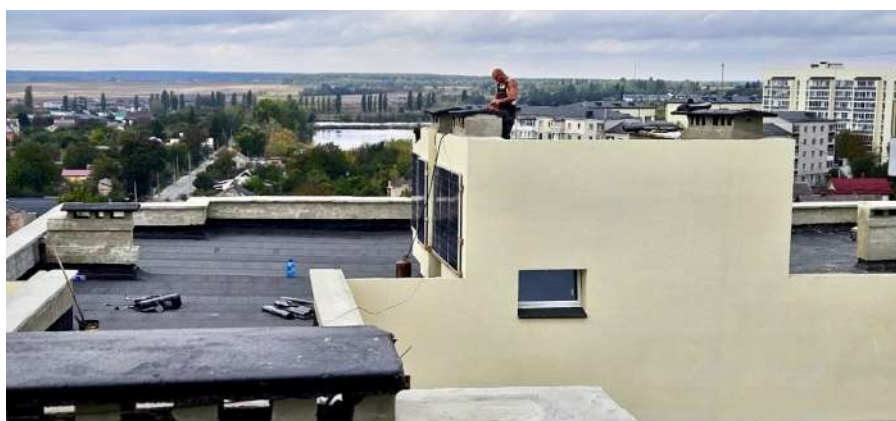
Restoration of an apartment house in Bucha, the Kyiv region