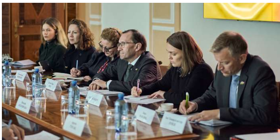
ESPEN BARTH EIDE, Minister of Foreign Affairs of Norway:

As a result of this cooperation, more than 67 thousand families have received assistance in repairing their homes. It is an unprecedented figure worldwide and has no analogs.