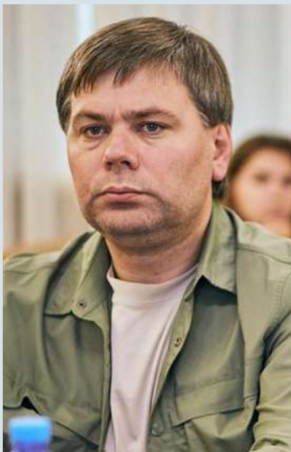
Vasyl SHKURAKOV, the First Deputy Minister for Communities, Territories and Infrastructure Development of Ukraine:

An essential aspect of restoring a decent life for Ukrainians, even in the face of the ongoing war, is the provision of modern and safe educational facilities. With the support of our European partners under the EIB's recovery programs, we are seeing tangible results: today, we are opening two renovated schools in the Vinnytsia region, enabling more than 700 students to continue their education there. Many other projects underway across Ukraine are making a significant contribution to our recovery efforts.