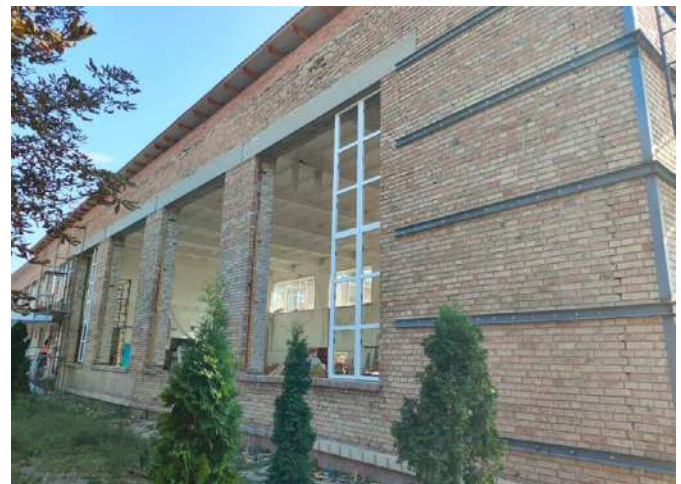
Reconstruction lyceum in Makariv, the Kyiv region under EIB Ukraine Recovery Program

*As of September 13th, 2024, according to regional military administrations since February 24th, 2022