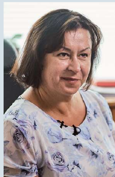
Natalia KOZLOVSKA, Deputy Minister for Communities, Territories and Infrastructure Development of Ukraine:

During the full-scale invasion and significant destruction of housing infrastructure caused by Russia, Ukraine, with the participation of a wide range of international partners, continues to work on the modernization of housing policy. Also, despite the ongoing military aggression, we have successfully implemented a compensation policy for damaged and destroyed property. We cannot afford to wait for the end of hostilities; the country's restoration is happening here and now, according to the principle of "build back better."