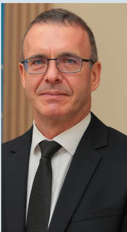
Jaco CILLIERS, UNDP Resident Representative to Ukraine:

An essential aspect of restoring a decent life for Ukrainians, even in the face of the ongoing war, is the provision of modern and safe educational facilities. With the support of our European partners under the EIB's recovery programs, we are seeing tangible results: today, we are opening two renovated schools in the Vinnytsia region, enabling more than 700 students to continue their education there. Many other projects underway across Ukraine are making a significant contribution to our recovery efforts.