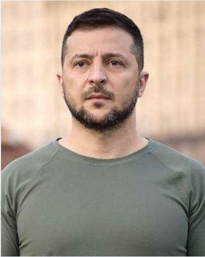
Volodymyr ZELENSKYI, President of Ukraine:

Russian missile against a wheat cargo bound for Egypt. Russia launched a strike on an ordinary civilian vessel in the Black Sea right after it left Ukrainian territorial waters. Fortunately, there were no casualties, according to preliminary reports.