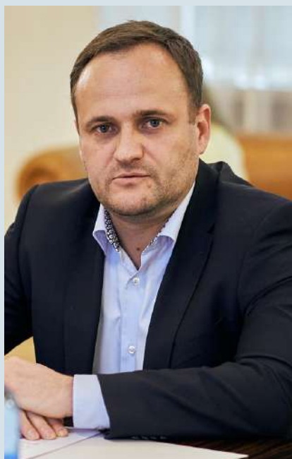
Oleksiy KULEBA, Deputy Prime Minister for the Restoration of Ukraine—Minister for Communities and Territories Development of Ukraine:

Ukrzaliznytsia and the EBRD plan to implement an investment project to renew the fleet of electric locomotives with an EBRD loan under a state guarantee of up to EUR 300 million. Moreover, Ukrzaliznytsia experiences a significant electricity shortage, which will increase in the winter. Therefore, financing the construction of gas power plants in different regions of Ukraine is needed.