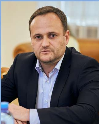
Oleksiy KULEBA, Deputy Prime Minister for the Restoration of Ukraine - Minister for Communities and Territories Development of Ukraine

Russian missile attacks on civilian ships and port infrastructure are deepening the global food crisis.