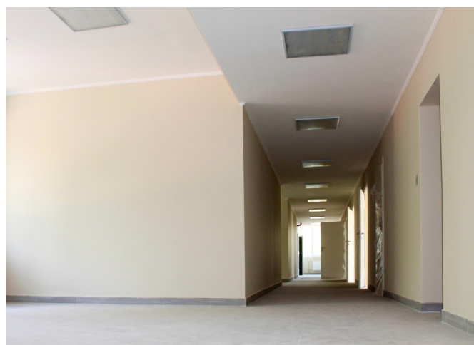
Restoration of damaged hospital in Trostianets, the Sumy region

*As of August 30th, 2024, according to regional military administrations since February 24th, 2022