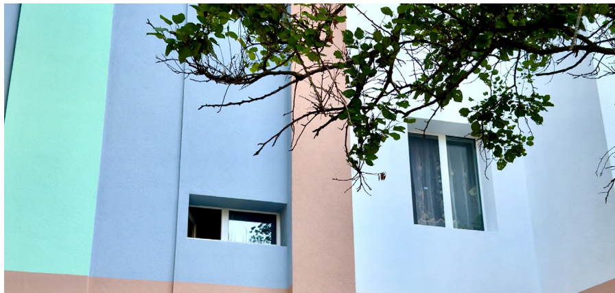
Restoration of an apartment building in Irpin, the Kyiv region