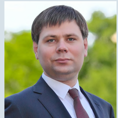
Vasyl SHKURAKOV, Acting Minister for Communities, Territories and Infrastructure Development of Ukraine:

The Government, local authorities, and associations are united to provide the population with vital utilities, electricity, water, and heat. Particular attention is paid to social facilities: kindergartens, schools, and healthcare institutions. This is also to ensure a trouble-free heating season in 2024-2025. To increase energy consumption efficiency in residential and public buildings and provide them with alternative power sources and electricity storage systems, Ukraine has developed and launched the necessary incentives that communities, businesses, and citizens can effectively use.