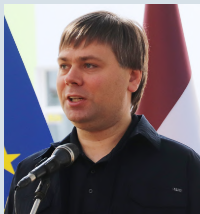
Vasyl SHKURAKOV, Acting Minister for Communities, Territories and Infrastructure Development of Ukraine:

The restoration of the lyceum building, damaged by explosive waves and debris, is significant for this region. The village where the lyceum is located was under Russian occupation. It is essential for us that the children continue their education in proper conditions, as it is impossible to provide quality education without it. Currently, 146 students are enrolled in the school, 6 of whom are internally displaced persons.