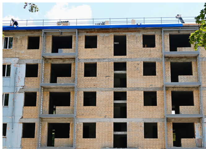
Restoration of an apartment building in Zaporizhzhia

*As of August 23rd, 2024, according to regional military administrations since February 24th, 2022