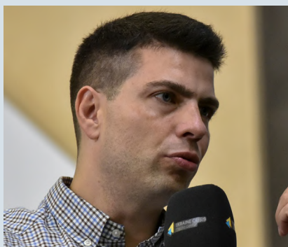
Serhii DERKACH, Deputy Minister for Communities, Territories and Infrastructure Development of Ukraine:

The memorandum also provides for the establishment of a steering committee to set priorities and develop step-by-step plans to achieve the parties' common goals.