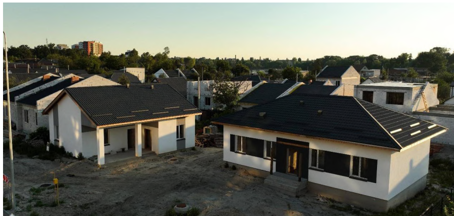
Restoration of damaged private houses in Irpin, the Kyiv region