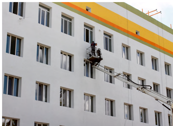
Restoration of the city hospital in Trostianets, the Sumy region

*As of August 9th, 2024, according to regional military administrations since February 24th, 2022