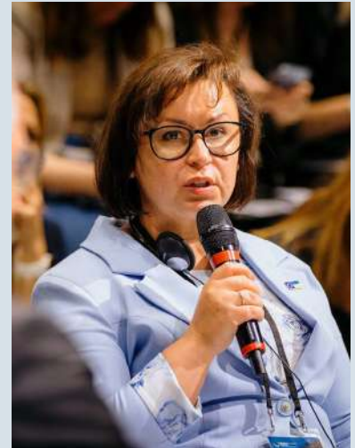
Natalia KOZLOVSKA, Deputy Minister for Communities, Territories and Infrastructure Development of Ukraine:

Residential Property project. The project will be implemented by the Ministry for Communities, Territories and Infrastructure Development of Ukraine. According to HOME, priority will be given to supporting the most vulnerable people, including combatants, people with disabilities, and large families. It is expected that over 2000 families will receive new housing with CEB funds.