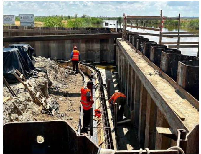
A bridge restoration in the Odesa region

*As of June 7th, 2024, according to regional military administrations since February 24th, 2022