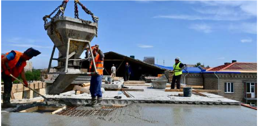
Restoration of a damaged apartment house in Zaporizhzhia