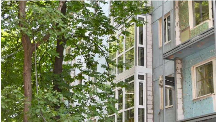
An apartment house restoration in Zaporizhzhia

World Bank Group representatives continue consultations on housing policy reform in Ukraine.