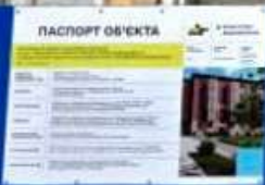
Restoration of a destroyed apartment building in Zaporizhzhia