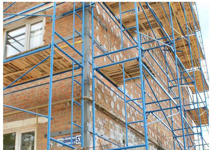
An apartment house restoration in Trostianets, the Sumy region

*As of May 24th, 2024, according to regional military administrations since February 24th, 2022