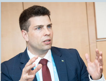
Serhii DERKACH, Deputy Minister for Communities, Territories and Infrastructure Development of Ukraine:

We had a fruitful meeting with Polly Trottenberg, Deputy Secretary at the US Department of Transportation. The parties discussed the priorities for recovery this year, including road and bridge repairs, expansion of checkpoints, and railroad upgrades. Ukraine continues to work with the United States to develop export logistics and transportation infrastructure.