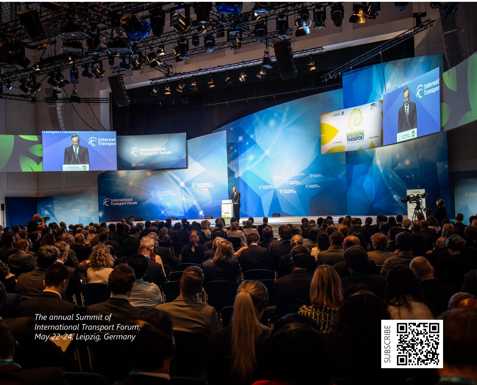
The annual Summit of International Transport Forum, May 22-24, Leipzig, Germany