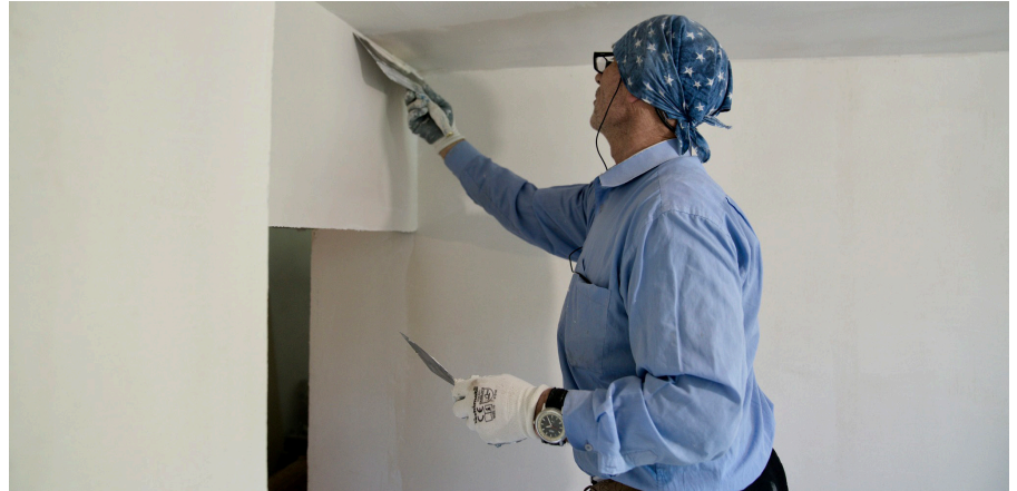
Apartment house restoration in Serhiivka, the Odesa region