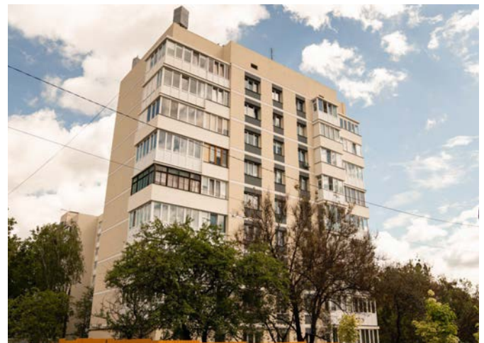
An apartment house restoration in Bucha, the Kyiv region

*As of May 20th, 2024, according to regional military administrations since February 24th, 2022