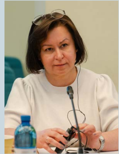
Natalia KOZLOVSKA, Deputy Minister for Communities, Territories and Infrastructure Development of Ukraine:

● The United Nations General Assembly mandates UN-HABITAT to promote socially and environmentally sustainable cities. UN-HABITAT works with partners to build inclusive, safe, resilient cities and communities by fostering urbanization and reducing inequality, discrimination, and poverty. UN-Habitat has gained experience implementing such projects, participating in post-conflict reconstruction in Syria, Yemen, Lebanon, and Kosovo countries, and globally advising national and regional governments.